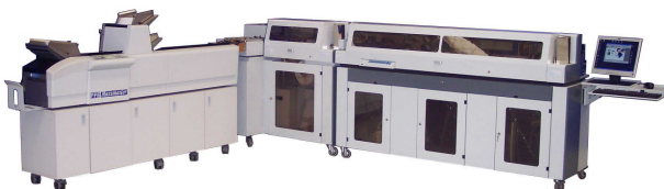
MS20 in line with ZT20

The Maximailer can also be configured with other feeder modules to insert attachments (from a single A4 sheet to 4 mm thick booklets).